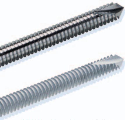
XCaliber Bone Screw