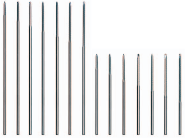
XCaliber OsteoTite Bone Screw